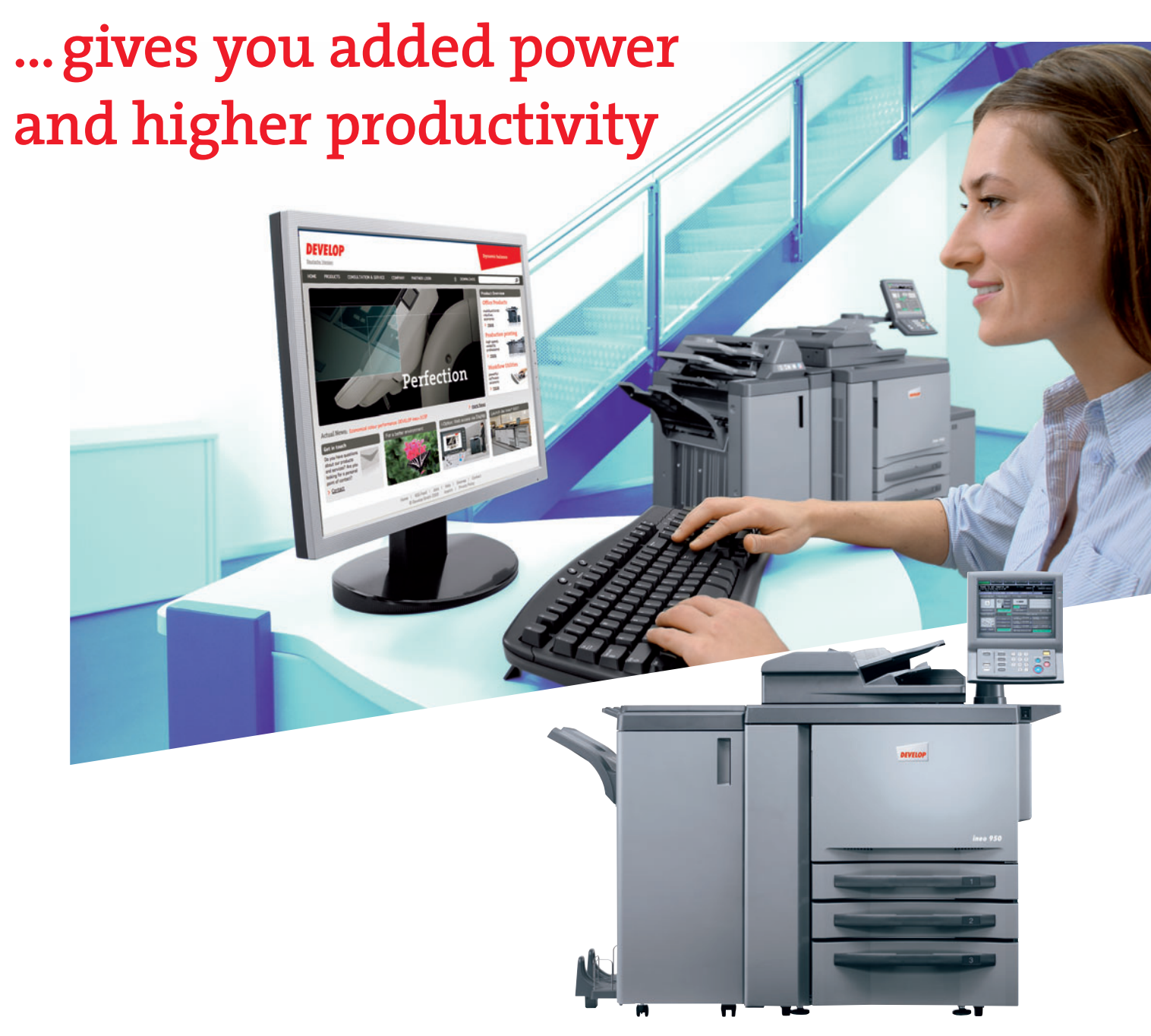
ineo 950 with booklet finisher FS-611